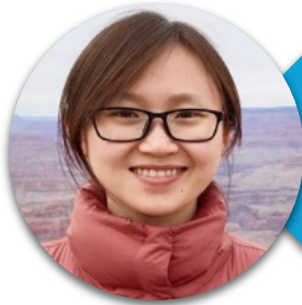
Feng Long University of Arizona

rates show brighter and more extended O VI emission in their CGM. However, the galactic winds in the simulation are too hot to be contributing strongly to the O VI emission -- instead, it is the cooler inflows and the circulating warm gas that emit the most -- suggesting that the mock emission is actually tracing the fuel for star formation rather than galactic outflows themselves. These results will provide the basis for interpretation of the eventual Aspera observations, or will suggest an interesting new investigation if the observational data do not match the simulation trends.