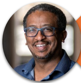
Sultan Hassan New York University

Radio-quiet AGN exhibit an excess of compact, nuclear mm emission. Given the presence of a magnetically-powered compact X-ray corona, the mm excess plausibly originates from synchrotron emission by relativistic, nonthermal electrons in the corona. To explain the observed flat mm spectral slope, we propose a model of an outflowing corona with an inhomogeneous magnetic field. When integrated over the outflow's height, the total spectrum becomes flat, with a spectral index around 0.5 depending on the model parameters. This model predicts a constant ratio between mm and X-ray luminosity with a value \sim 1e-5 , in good agreement with the observed L_{mm}/L_X correlation. We also discuss how the model addresses the observed mm and X-ray variability and the model's implications for dissipation mechanisms in the outflow.