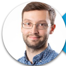
Charles Law University of Virginia

I will present the results of our recent studies of this fascinating object. We carried out a large observational campaign on Her X-1 with XMM-Newton, Chandra and NuSTAR X-ray telescopes and tracked the properties of its wind with height above the disk, producing the first ever 2D map of a disk wind. Secondly, by performing the first time-dependent photoionization plasma analysis in an X-ray binary, we constrained the wind number density. These measurements allow direct comparisons with three-dimensional global wind simulations to reveal the outflow launching mechanism.