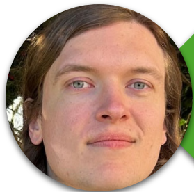
Alexander Dittmann Institute for Advanced Study

The detailed 3D distributions of dust density and extinction in the Milky Way have long been sought after. However, such 3D reconstruction from sparse data is non-trivial, but is essential to understanding the properties of star-formation, large-scale dynamics and structure of our Galaxy. In this work I will introduce our new fast and scalable algorithm for 3D dust modeling. Using advanced ML methods such as sparse Gaussian Processes and Variational Inference, our algorithm maps the solar neighbourhood with millions of input sources in parsec scales within short timescales. Using this approach we map the inner 3 kpc of the Solar neighbourhood down to 1 pc resolution. We identify large-scale structures in the Galaxy and its Molecular clouds, while simultaneously peering into individual molecular clouds, providing insights into multi-scale processes such as fragmentation in molecular clouds. From these maps, we extract 3D boundaries, volumes, precise dust masses (12% statistical uncertainty) and filling factors to study fragmentation within many well known Galactic Molecular clouds. We recover a wider range of substructures such as new interconnecting and free standing filaments and star-formation feedback and supernovae cavities.